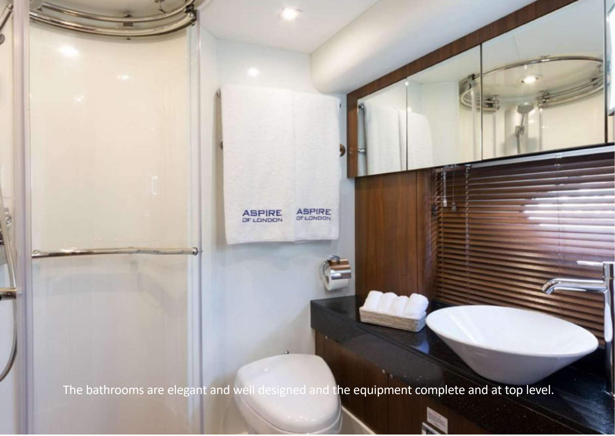
The bathrooms are elegant and well designed and the equipment complete and at top level.